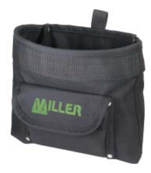
2 Pocket Nail & Tool Pouch