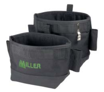
Open Bolt and Bull Pin Bags